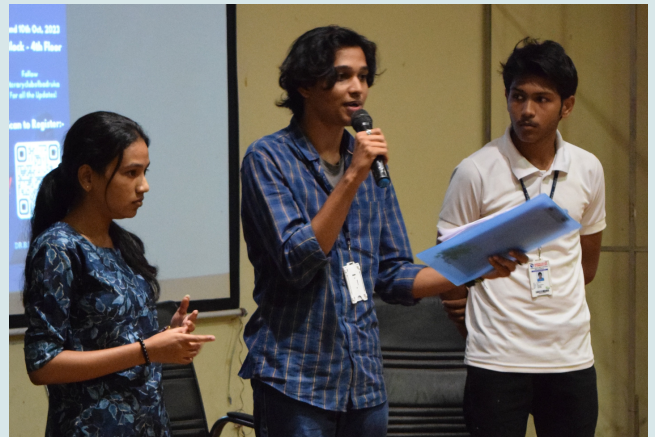
On 9th October 2023, the Literary Club Organized an event "CLASH OF MINDS - Don't Hate, Debate" on the occasion of World Mental Health Day.