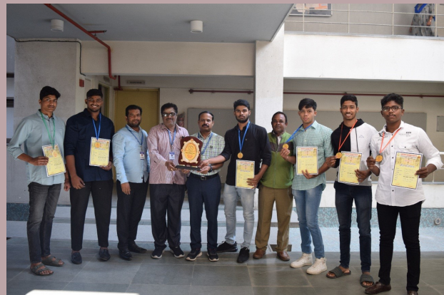
Table Tennis Tournament

Badruka College of Commerce & Arts took part in a Table Tennis tournament hosted by St. Joseph Degree & PG College on December 6th and 7th. Competing against other colleges, Badruka's team performed impressively, securing the 2nd position in the overall championship. This achievement highlights their skill, dedication, and competitive spirit in the sport. It also reflects positively on the college's commitment to fostering athletic excellence among its students. Such events not only promote sportsmanship but also provide an opportunity for students to showcase their talents beyond academics.