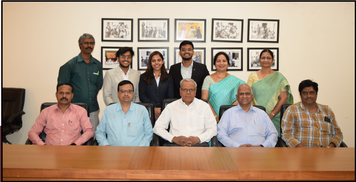
*The Editorial Team